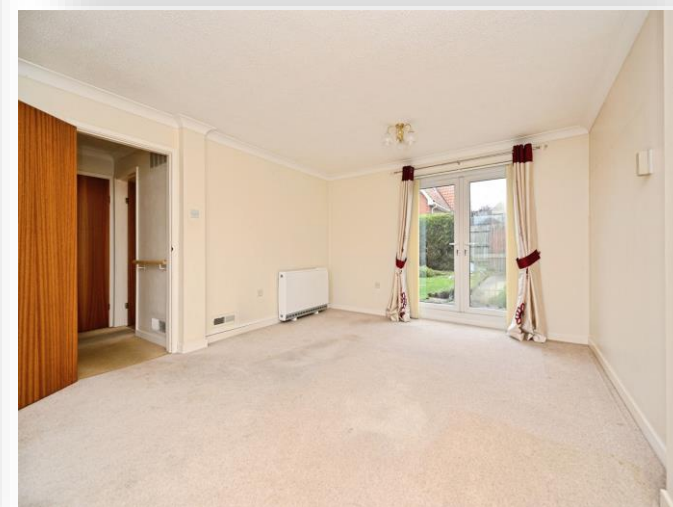
Hills Court, Hilgay, DOWNHAM MARKET, PE38 0QE