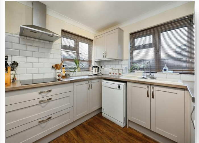
Willow Road, Downham Market, PE38 9PG