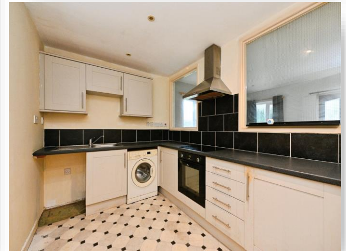
Rampant Horse Lane, Downham Market, PE38 9DQ