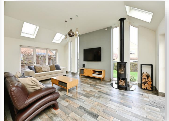
Holts Lane, Hilgay, DOWNHAM MARKET, PE38 0JG