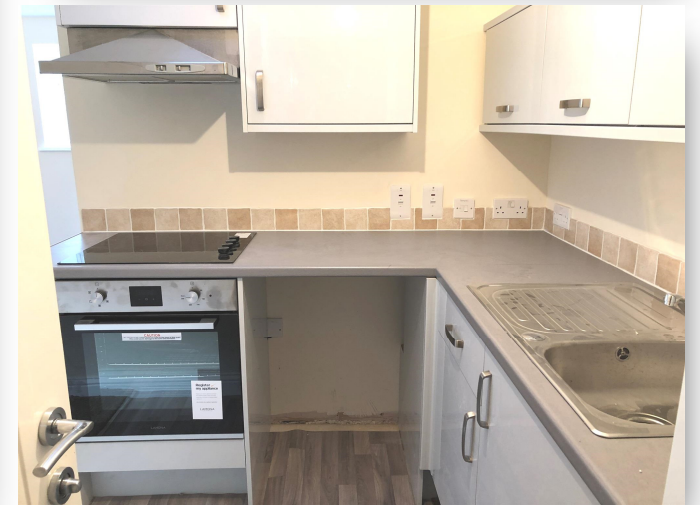
Lynn Road, Downham Market, PE38 9NN