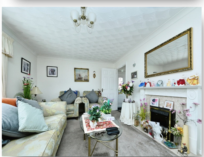
Oak Road, Stoke Ferry, King's Lynn, PE33 9TX