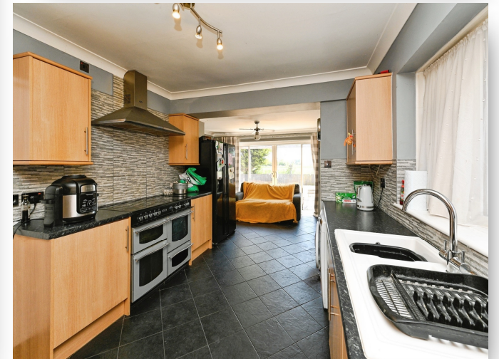
Listers Road, Upwell, Wisbech, PE14 9BW