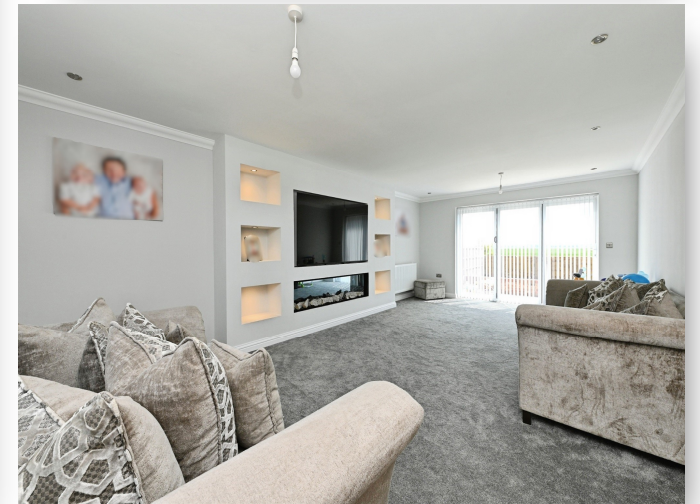
The Drove, Barroway Drove, Downham Market, PE38 0AL