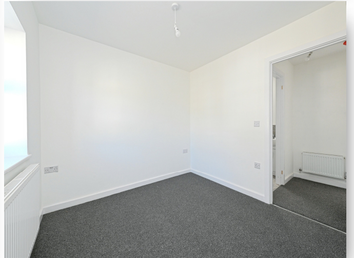
Railway Road, Downham Market, PE38 9DX