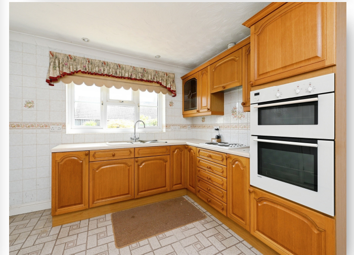
Greenwich Close, Downham Market, PE38 9TZ