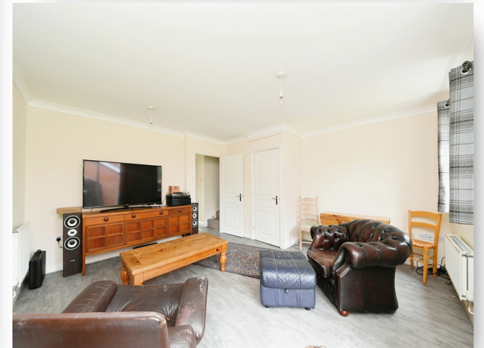
Mallard End, Downham Market, PE38 9HN