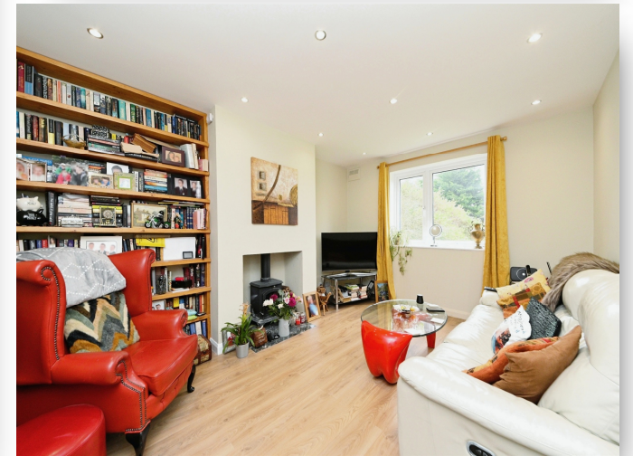
Main Road, Three Holes, Wisbech, PE14 9JS