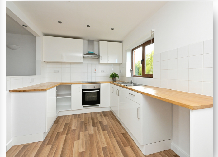
Fairview Cottages, Engine Road, Ten Mile Bank, Downham Market, PE38 0EN