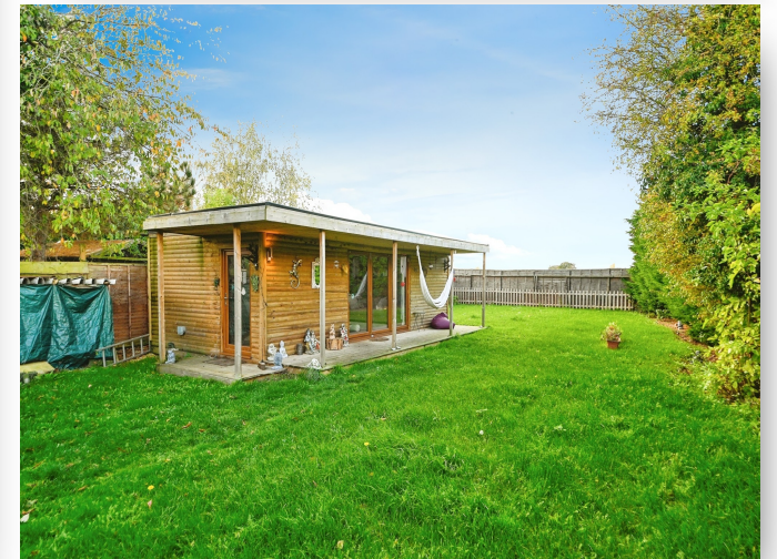
The Row, West Dereham, King's Lynn, PE33 9RH