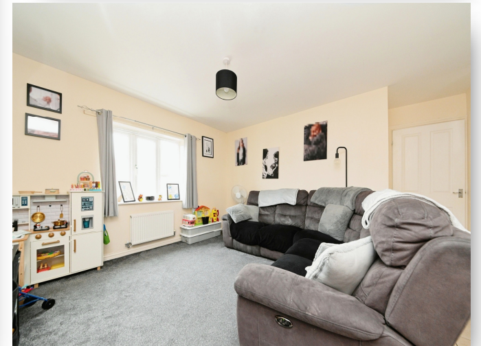
Winnold Street, Downham Market, PE38 9FE