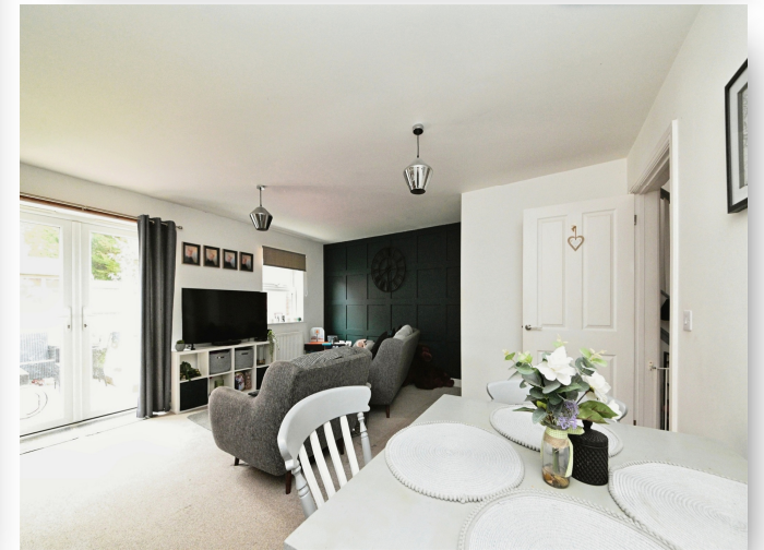
Leveret Gardens, Downham Market, PE38 9WG