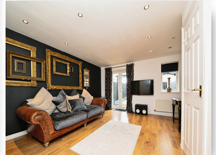
Coriander Road, Downham Market, PE38 9WB