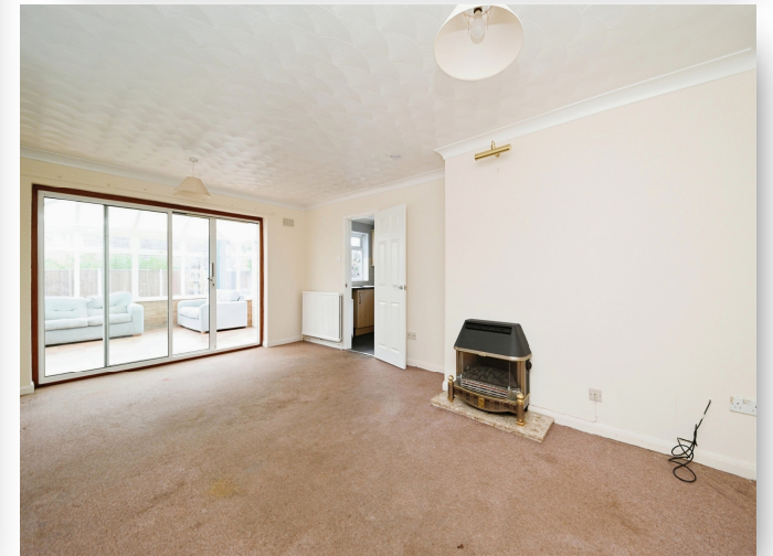
Hillcrest, Downham Market, PE38 9ND