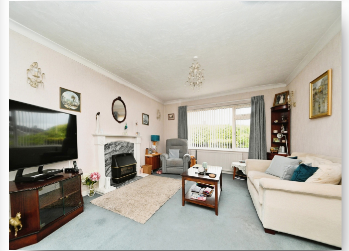
Low Hatters Close, Downham Market, PE38 9RR