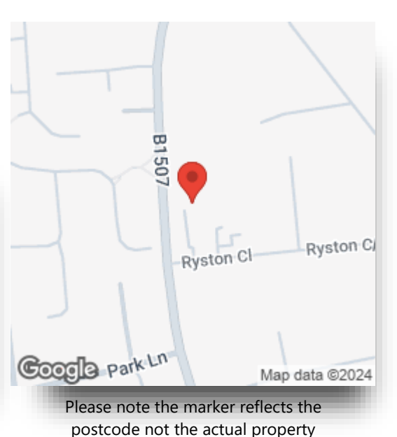
view this property online williamhbrown.co.uk/Property/DHM111883