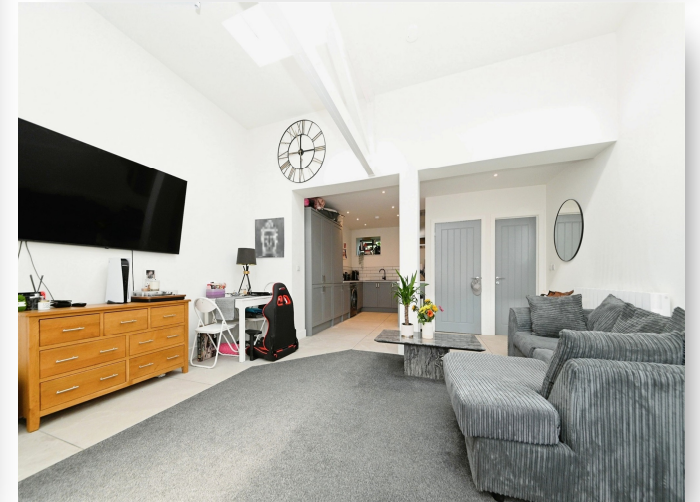
Ryston End, Downham Market, PE38 9AX