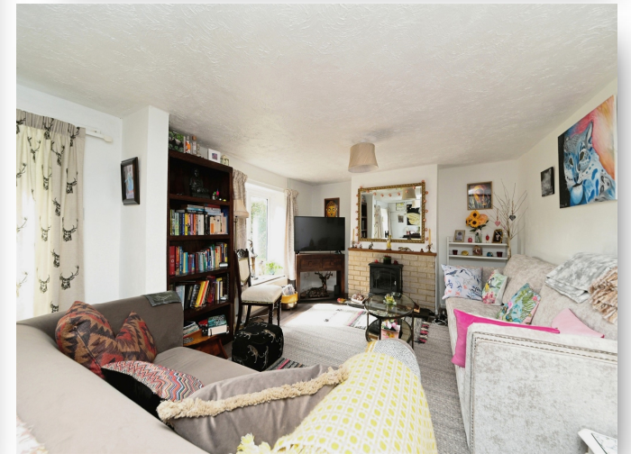
Poplar Cottages, Chapel Road, Boughton, King's Lynn, PE33 9AG