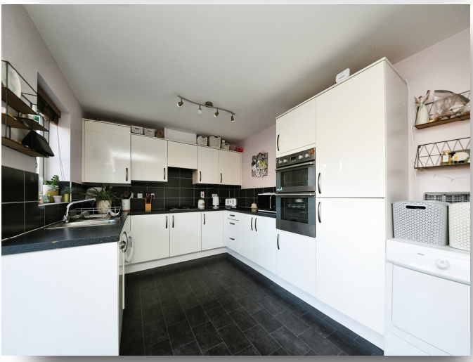
Langridge Circle, Watlington, KING'S LYNN, PE33 0UF