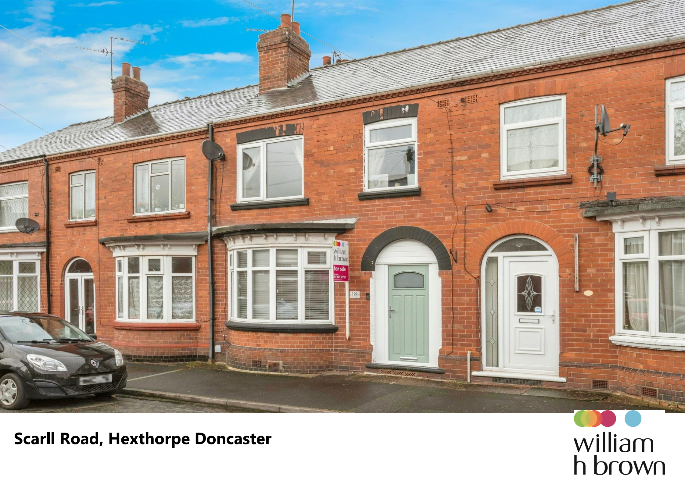
Scarll Road, Hexthorpe Doncaster