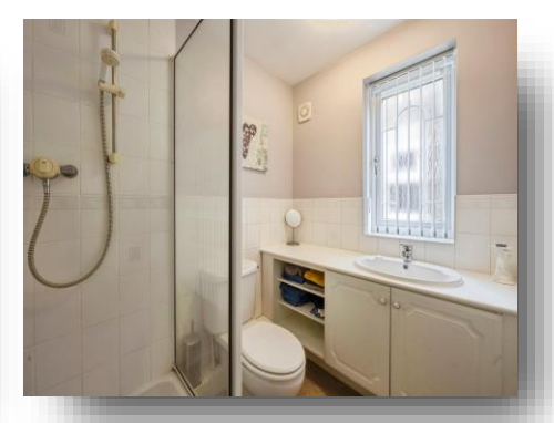
Coople Thomson Ave Map data @2025