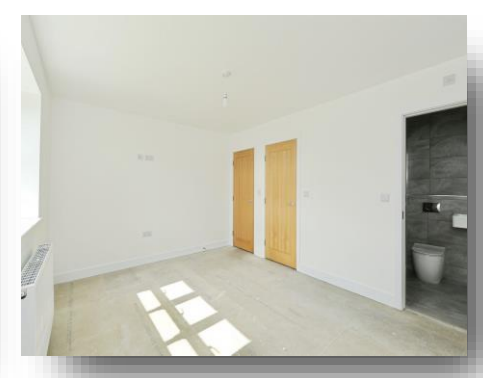
view this property online williamhbrown.co.uk/Property/DCR123749