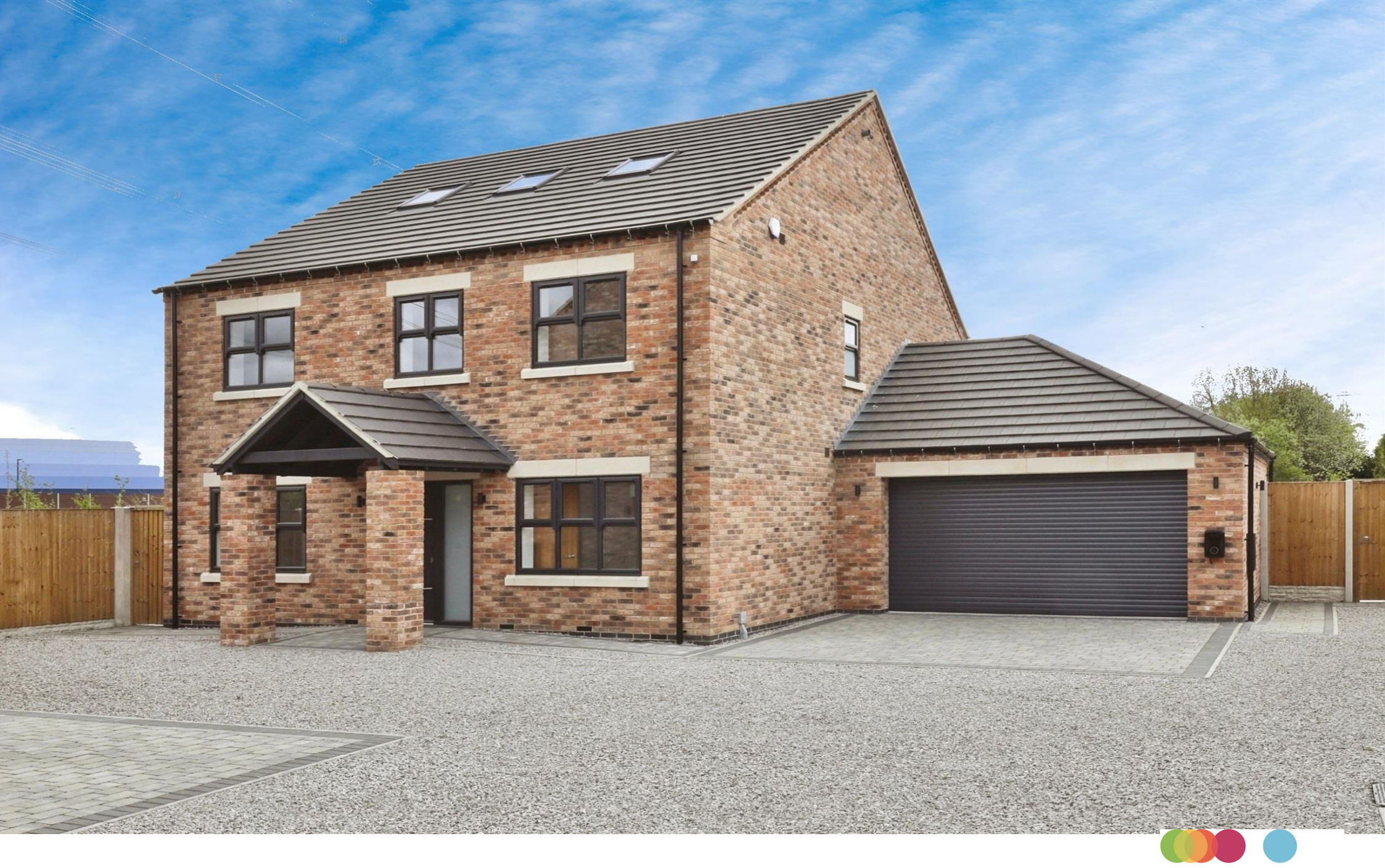
Whiphill Lane, Armthorpe Doncaster