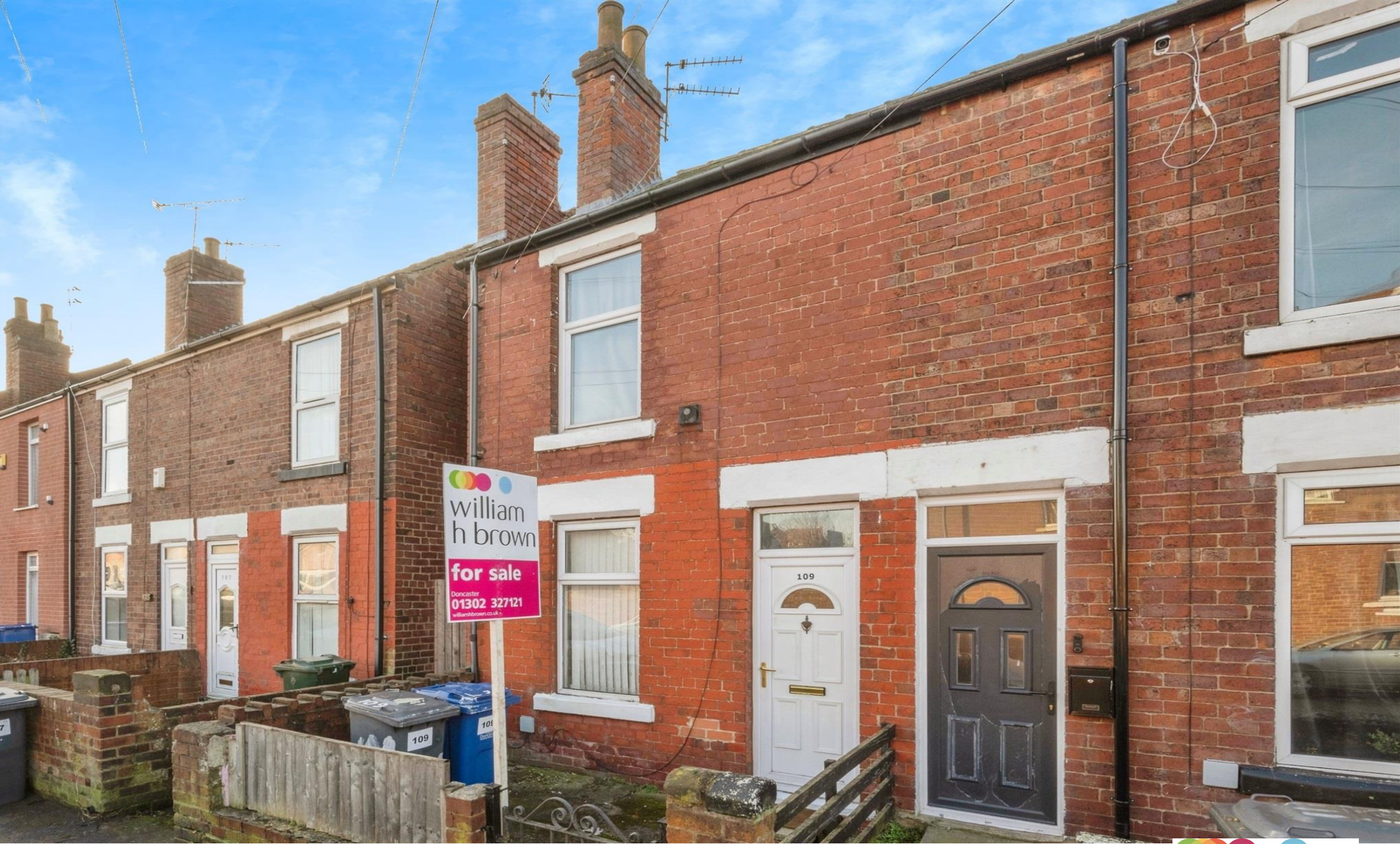
St. Johns Road, Balby Doncaster