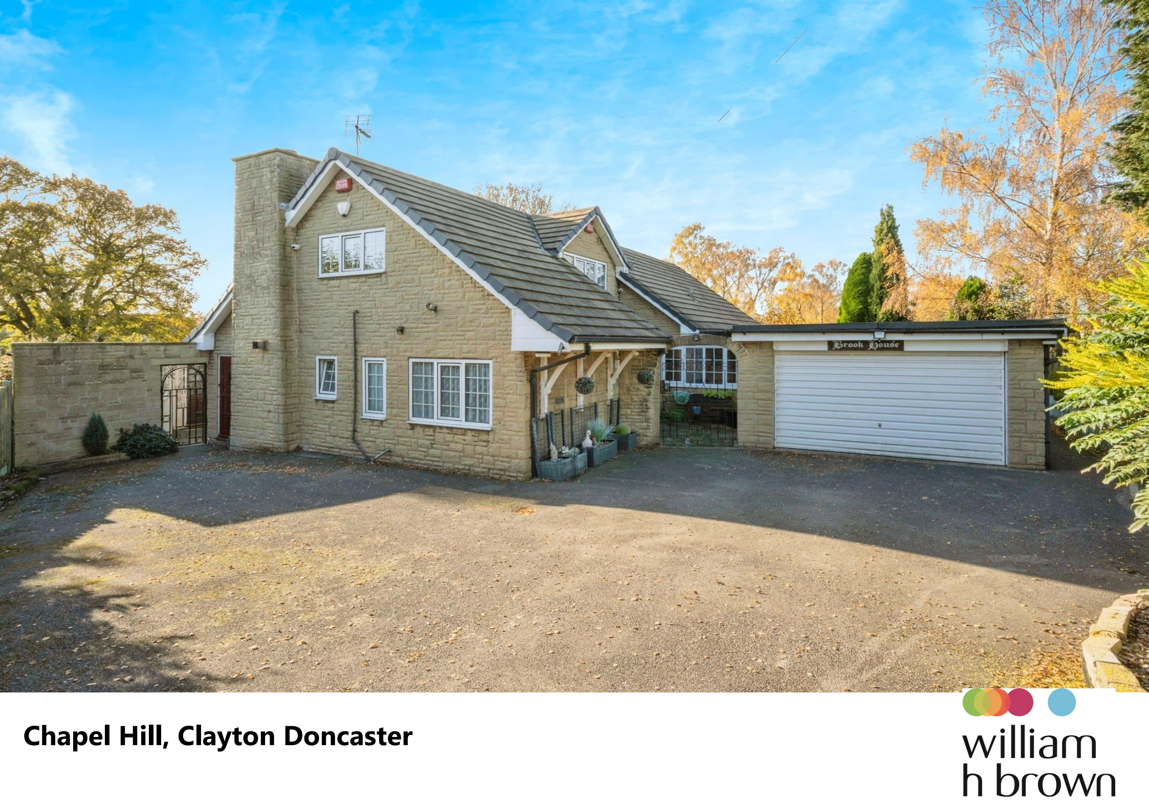
Chapel Hill, Clayton Doncaster