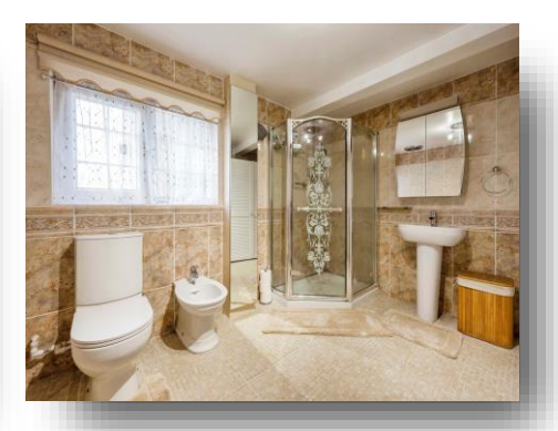
Church Field Rd Church Field Rd