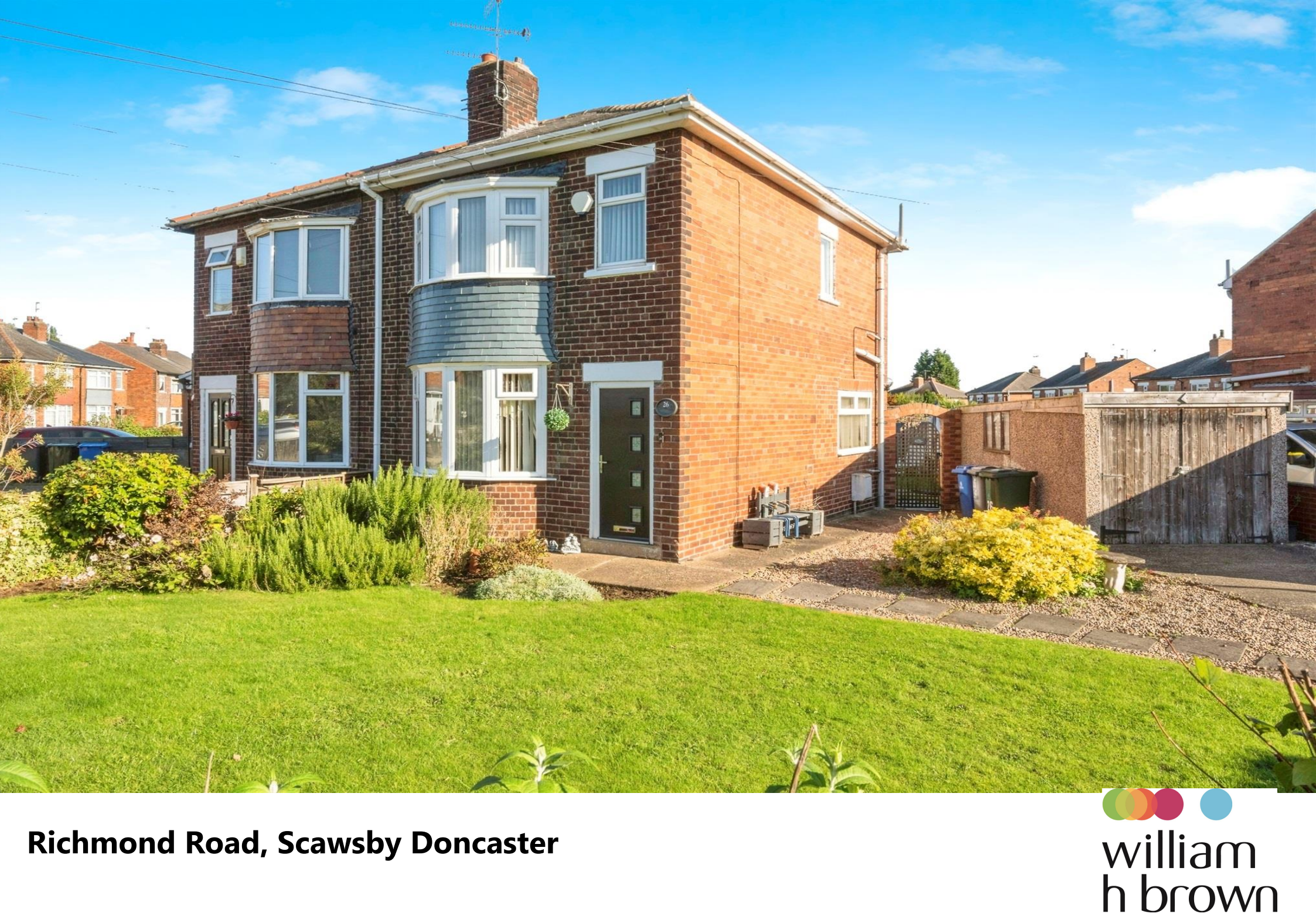
Richmond Road, Scawsby Doncaster