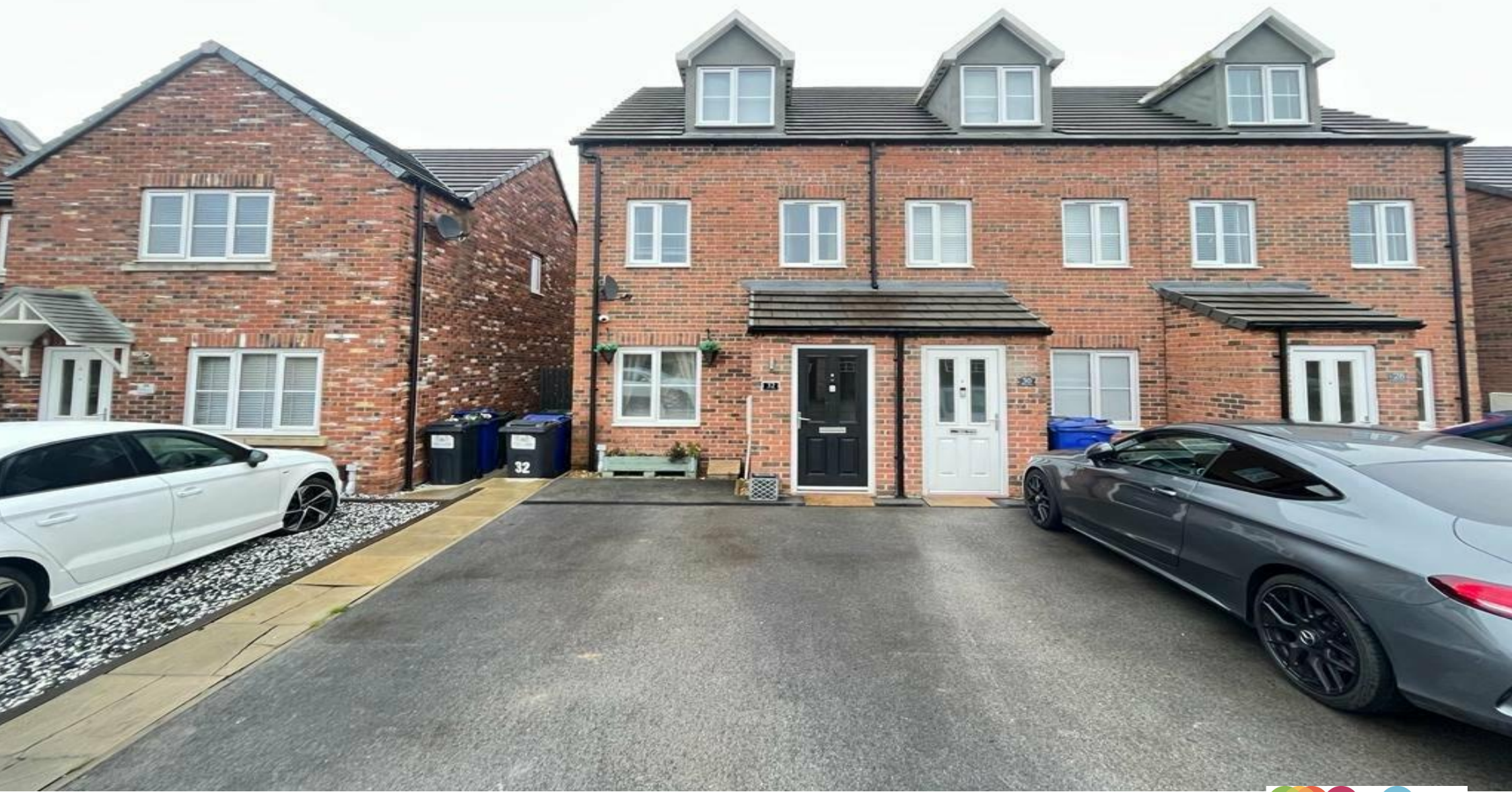
Fillies Avenue, Bessacarr Doncaster