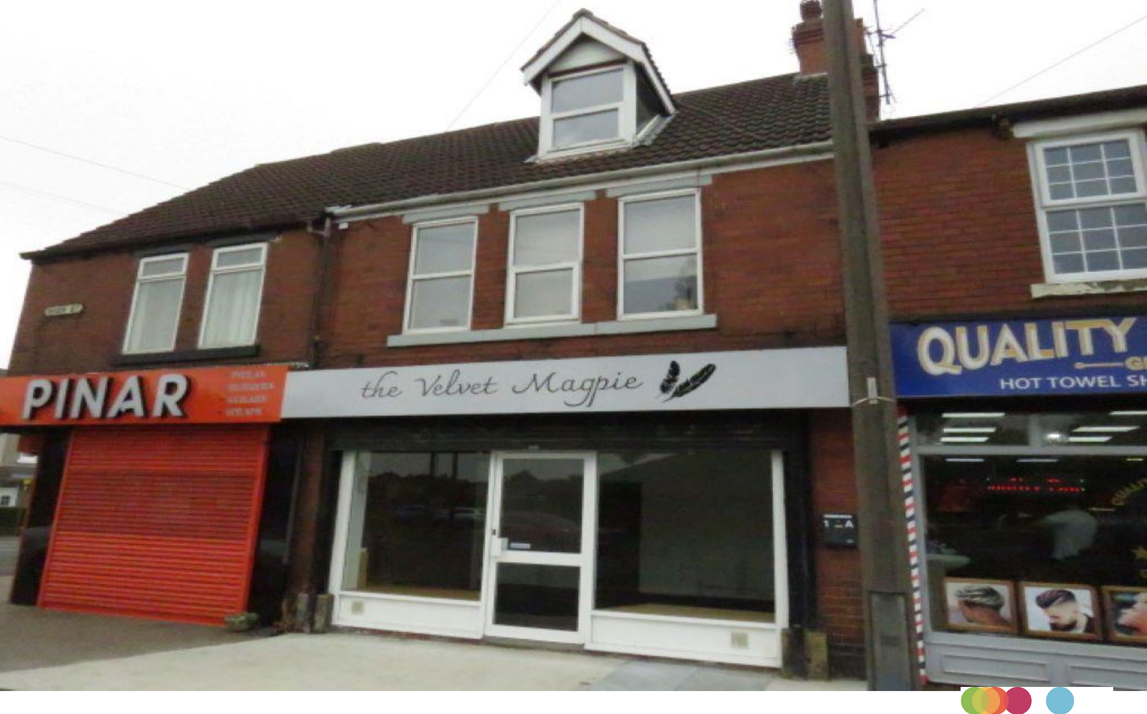
High Street, Carcroft Doncaster