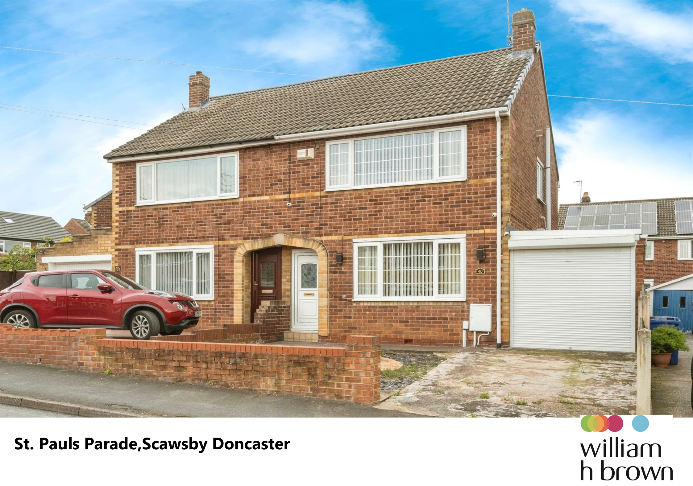
St. Pauls Parade, Scawsby Doncaster