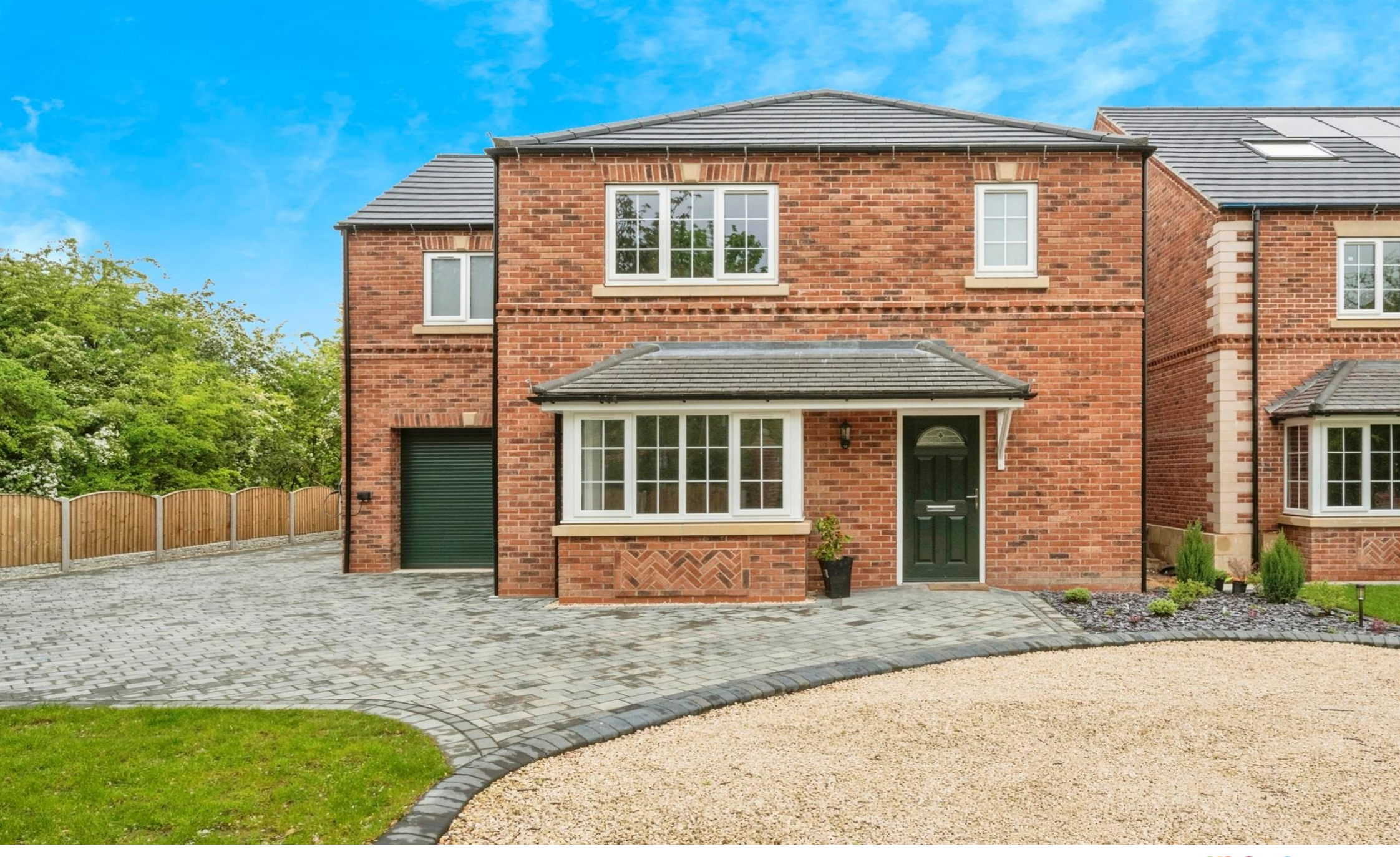
Cherry Blossom Court, Haxey Doncaster