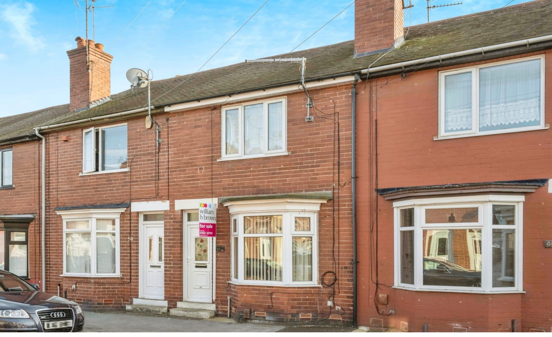
Scarth Avenue, Hexthorpe Doncaster