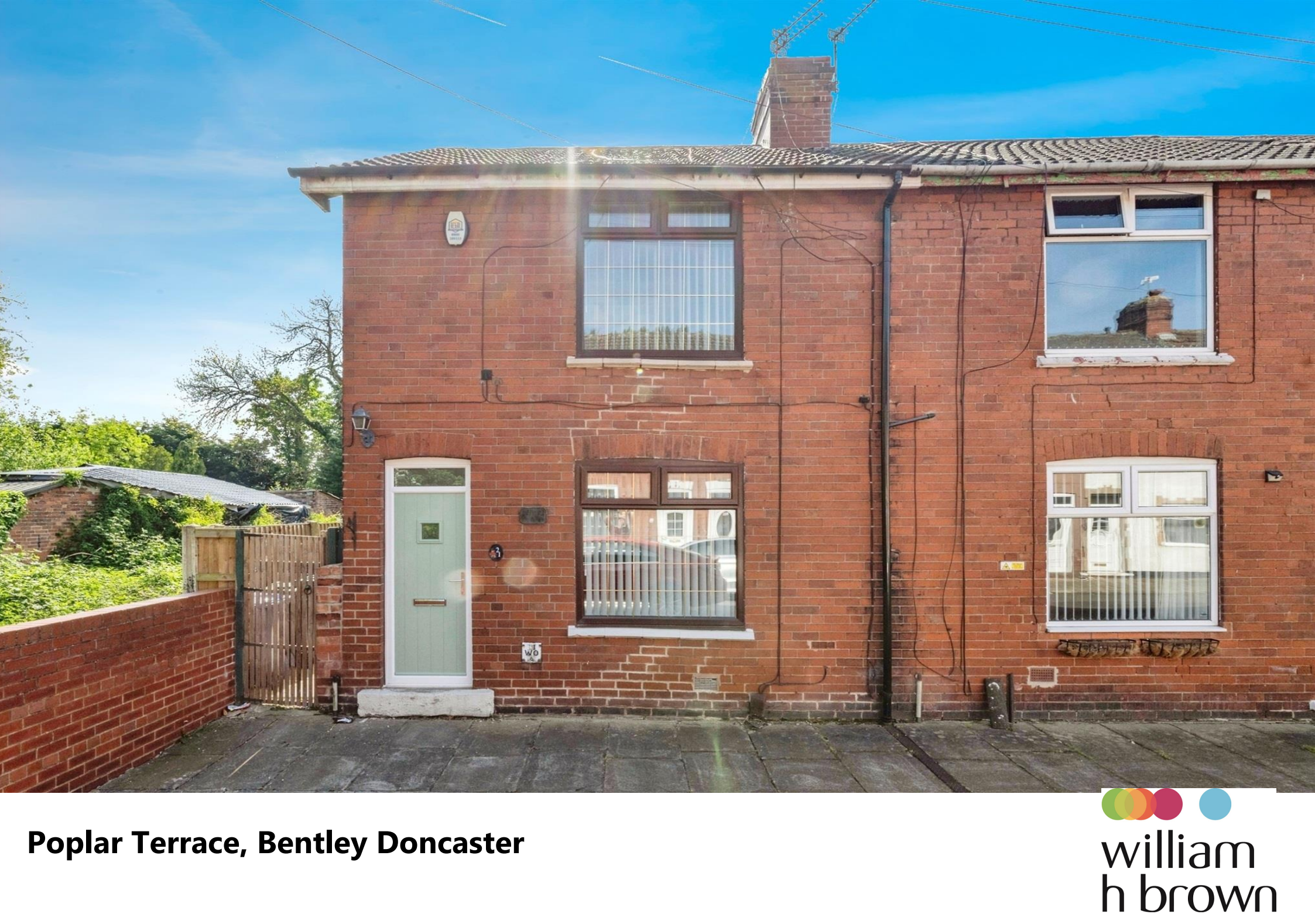
Poplar Terrace, Bentley Doncaster