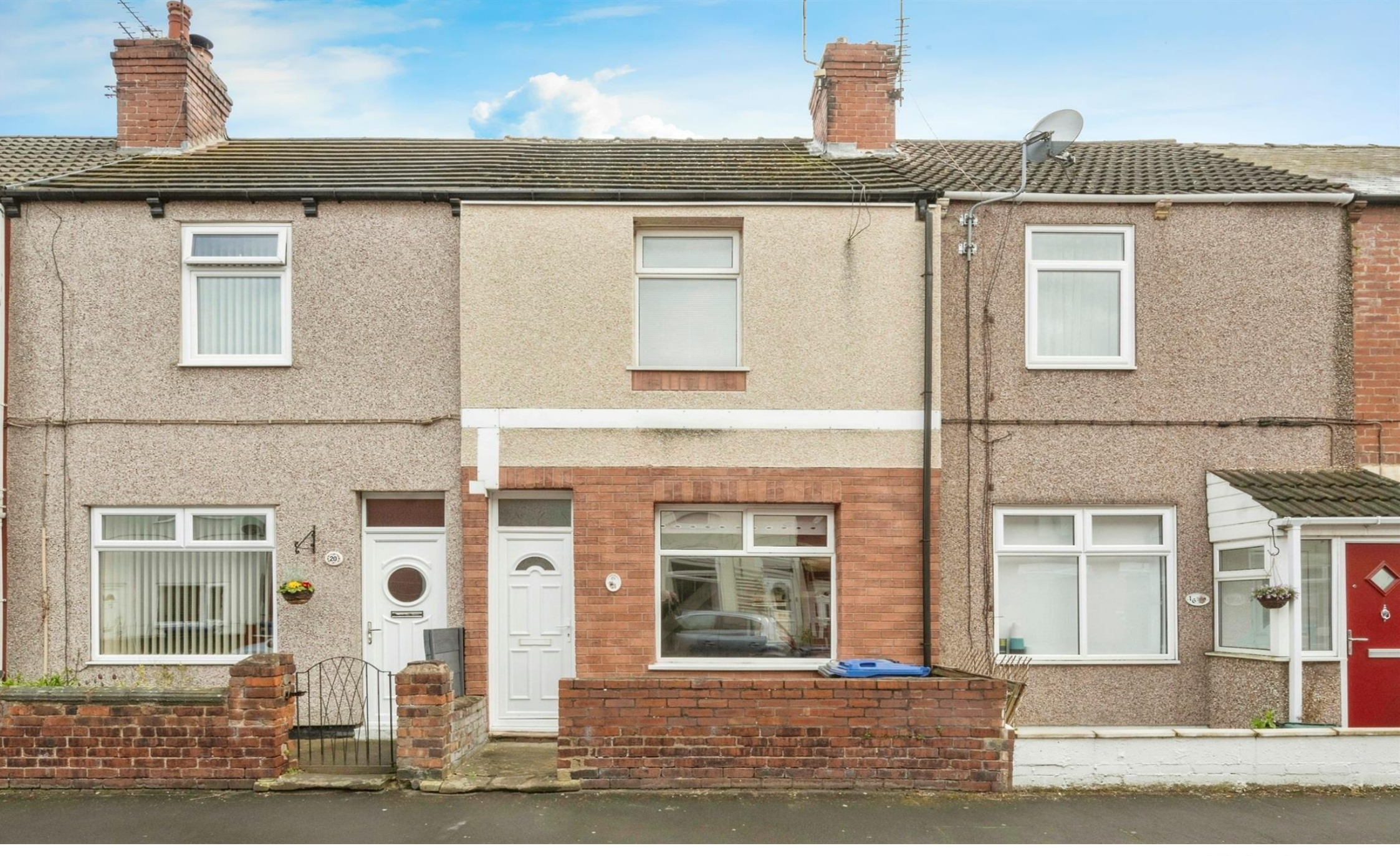
Kings Road, Askern Doncaster