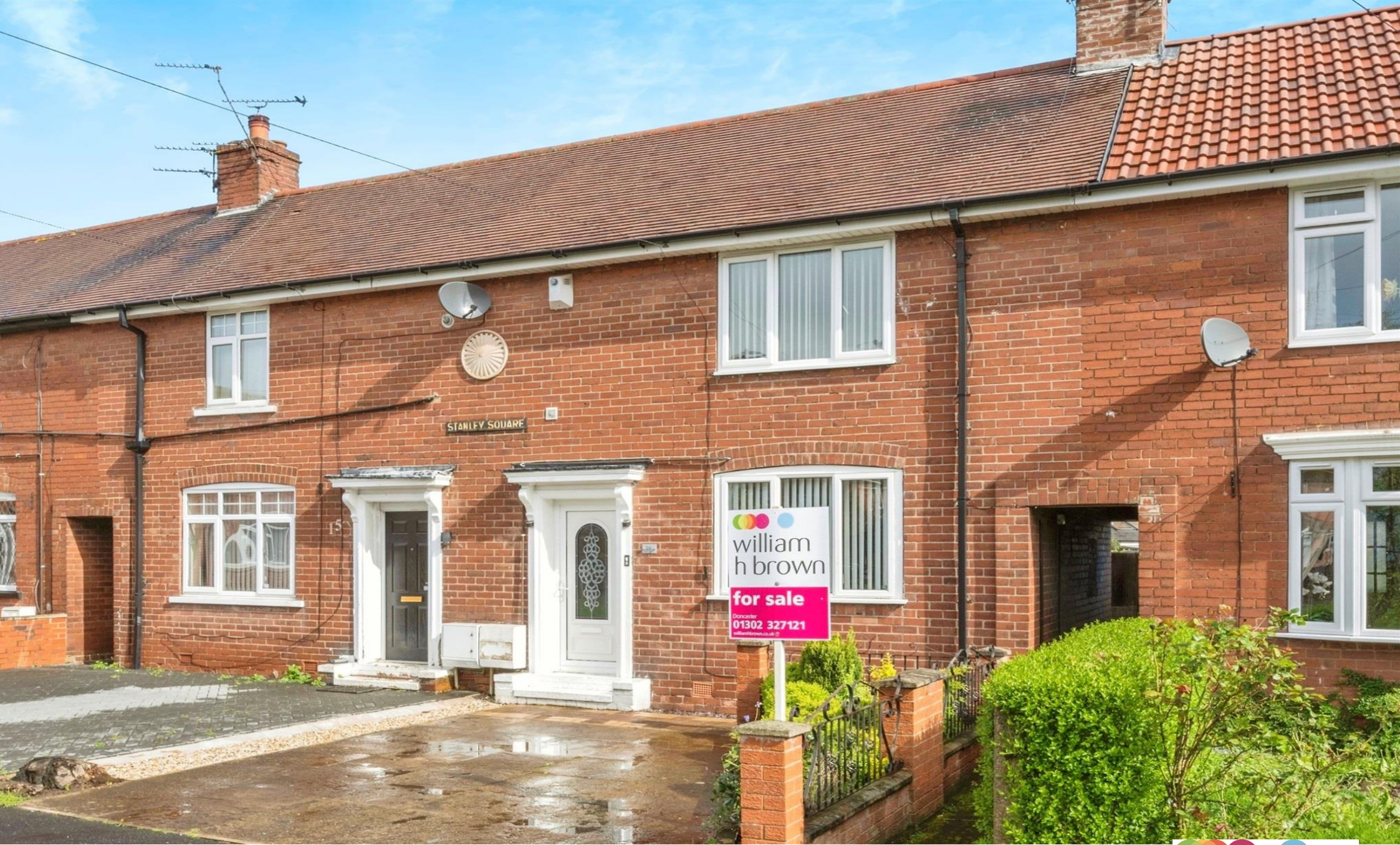
Stanley Square, Kirk Sandall Doncaster