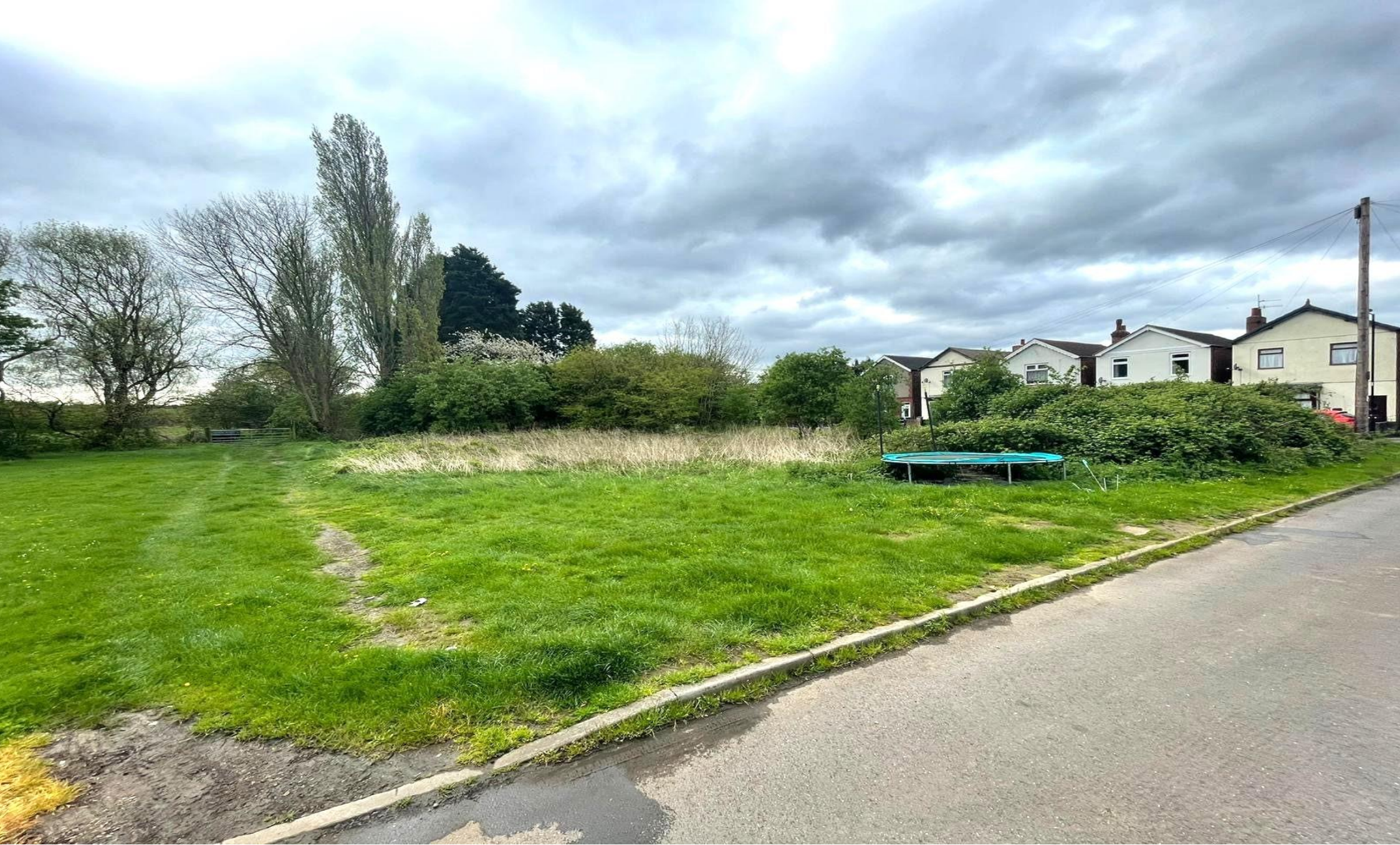
Land At The North East Side Of Adwick Avenue, Toll Bar Doncaster