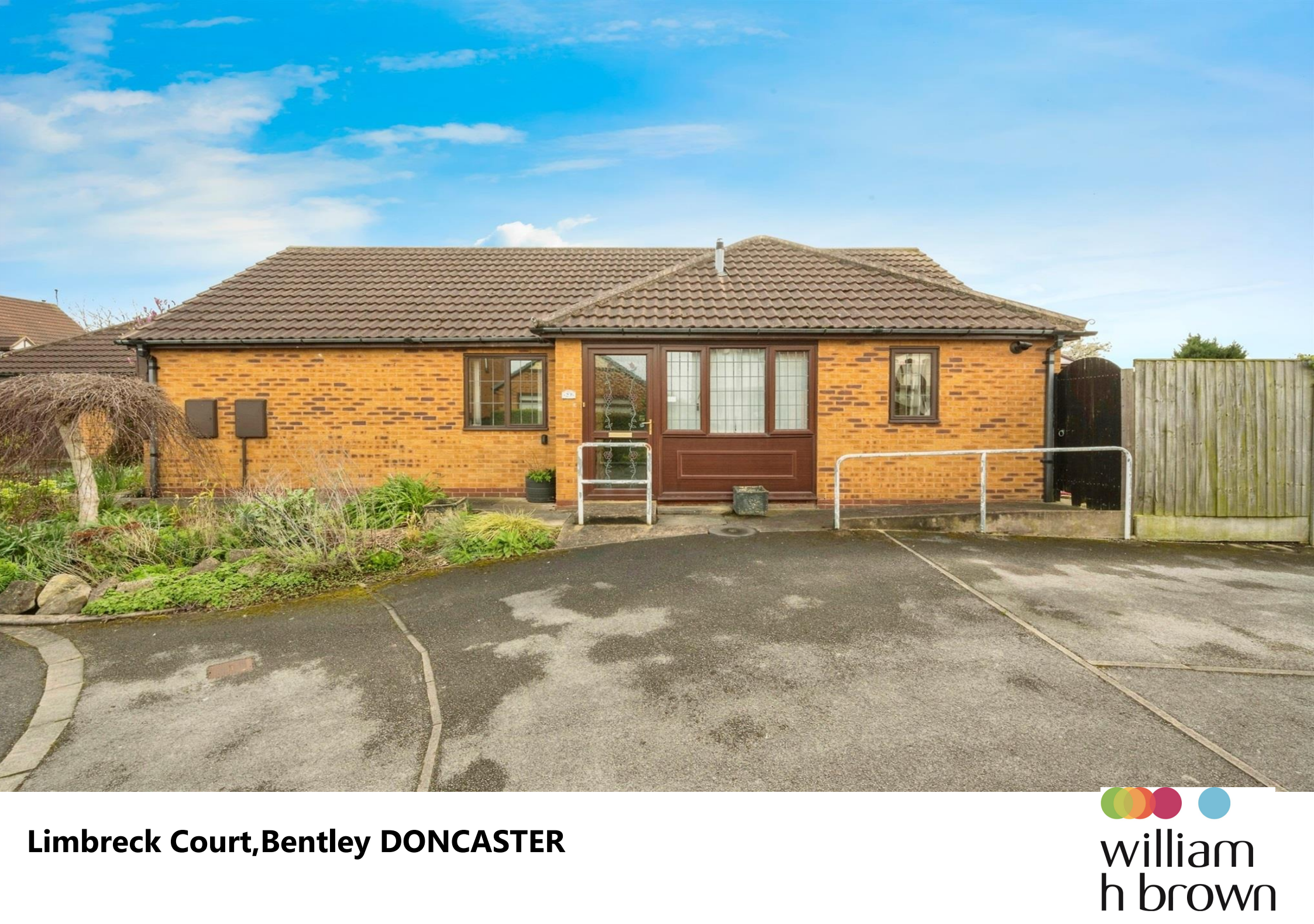
Limbreck Court, Bentley DONCASTER