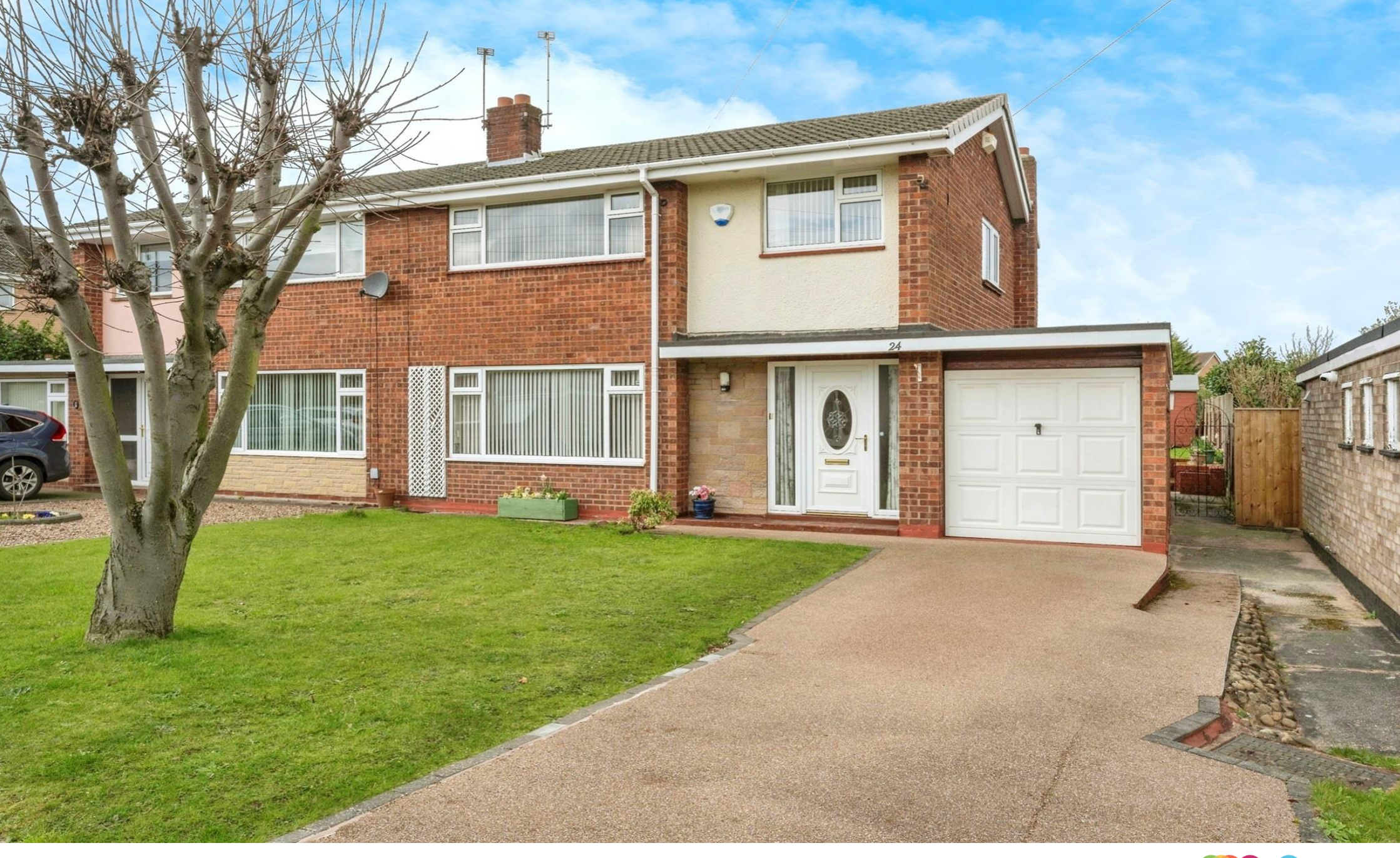
Heatherbank Road, Bessacarr DONCASTER