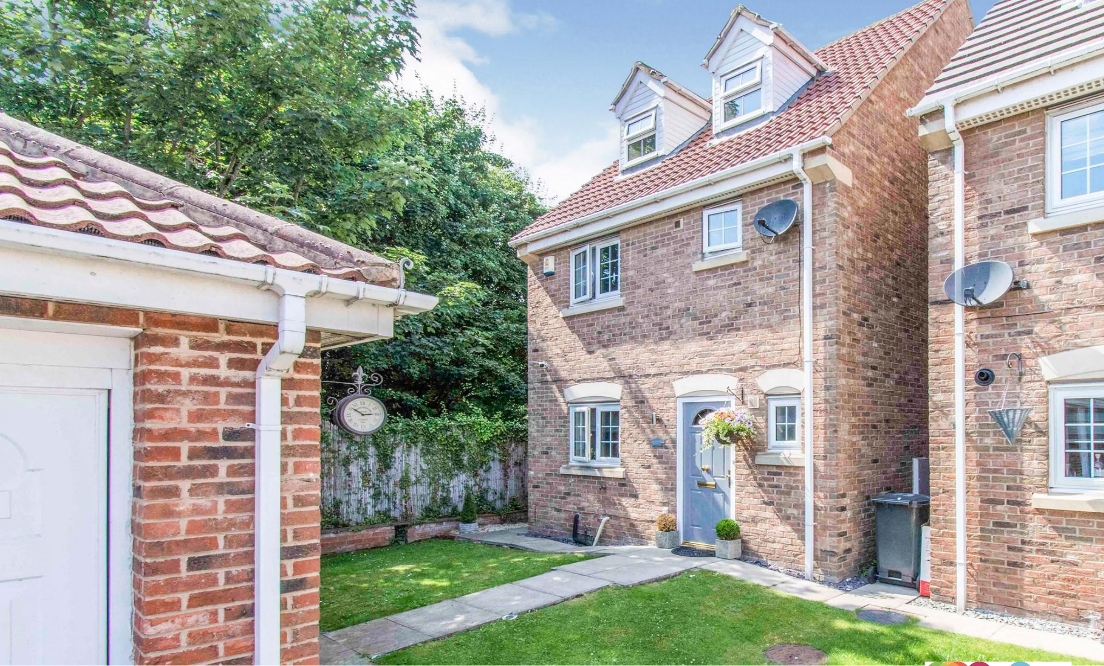
Greenfield Court, Balby Doncaster