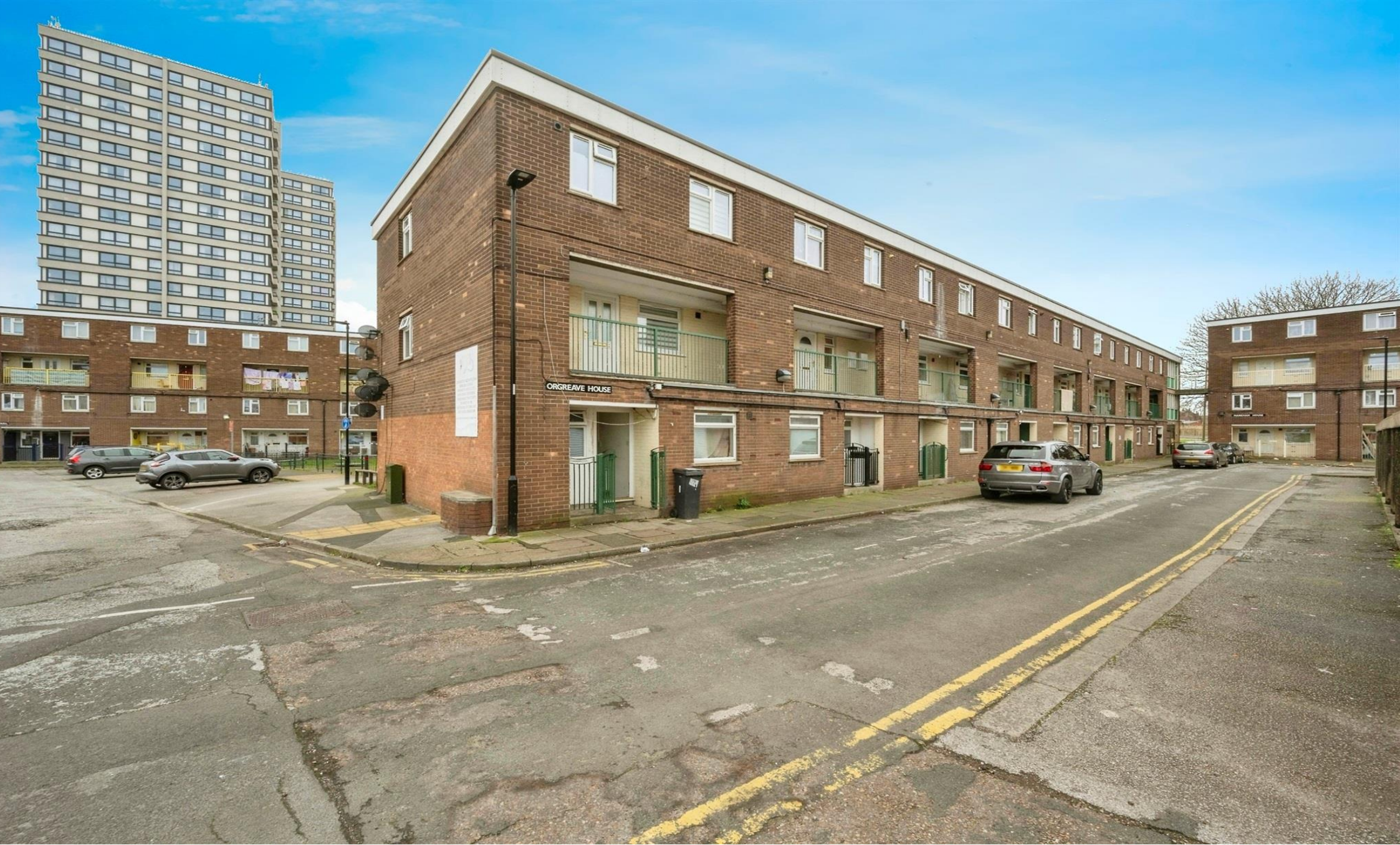
Orgreave House Burden Close, Town Doncaster