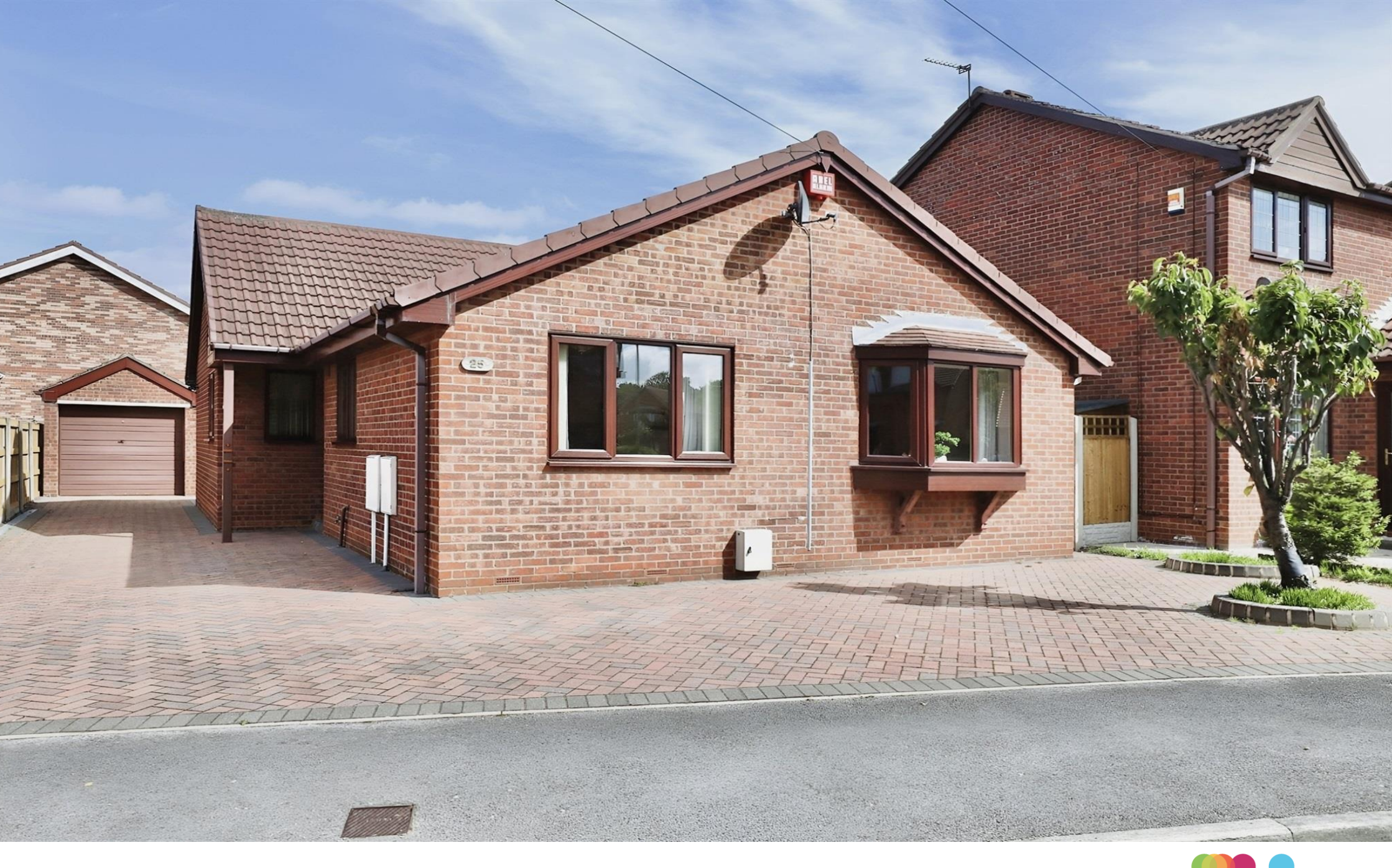
Pinefield Road, Barnby Dun Doncaster