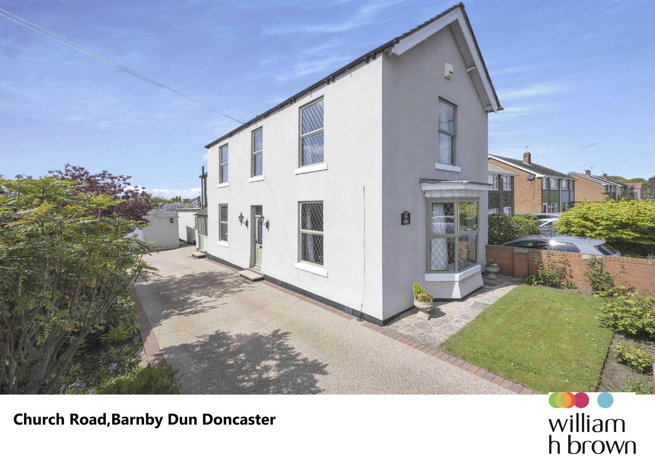
Church Road, Barnby Dun Doncaster