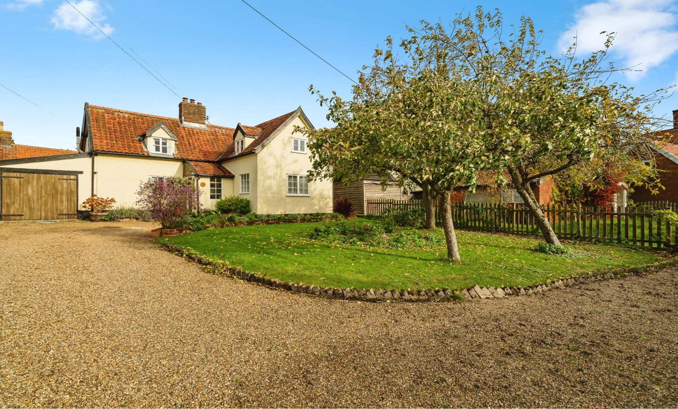
South View Common Road, Shelfanger Diss IP22 2DP