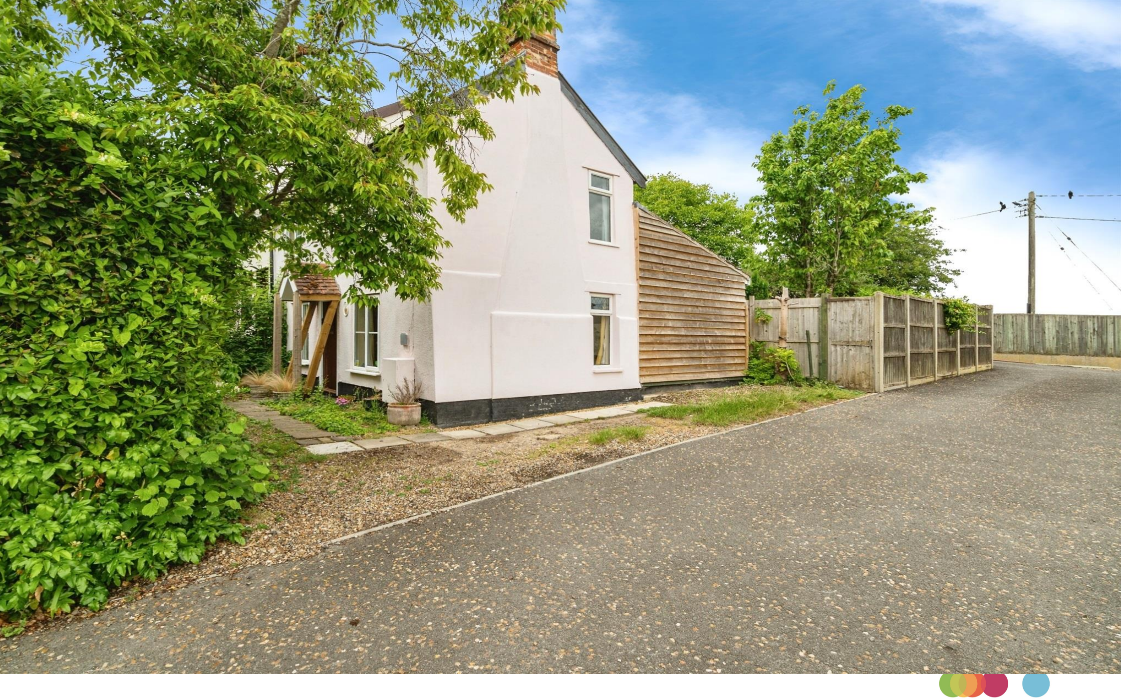
Keepers Cottage Long Green, Wortham Diss IP22 1PP