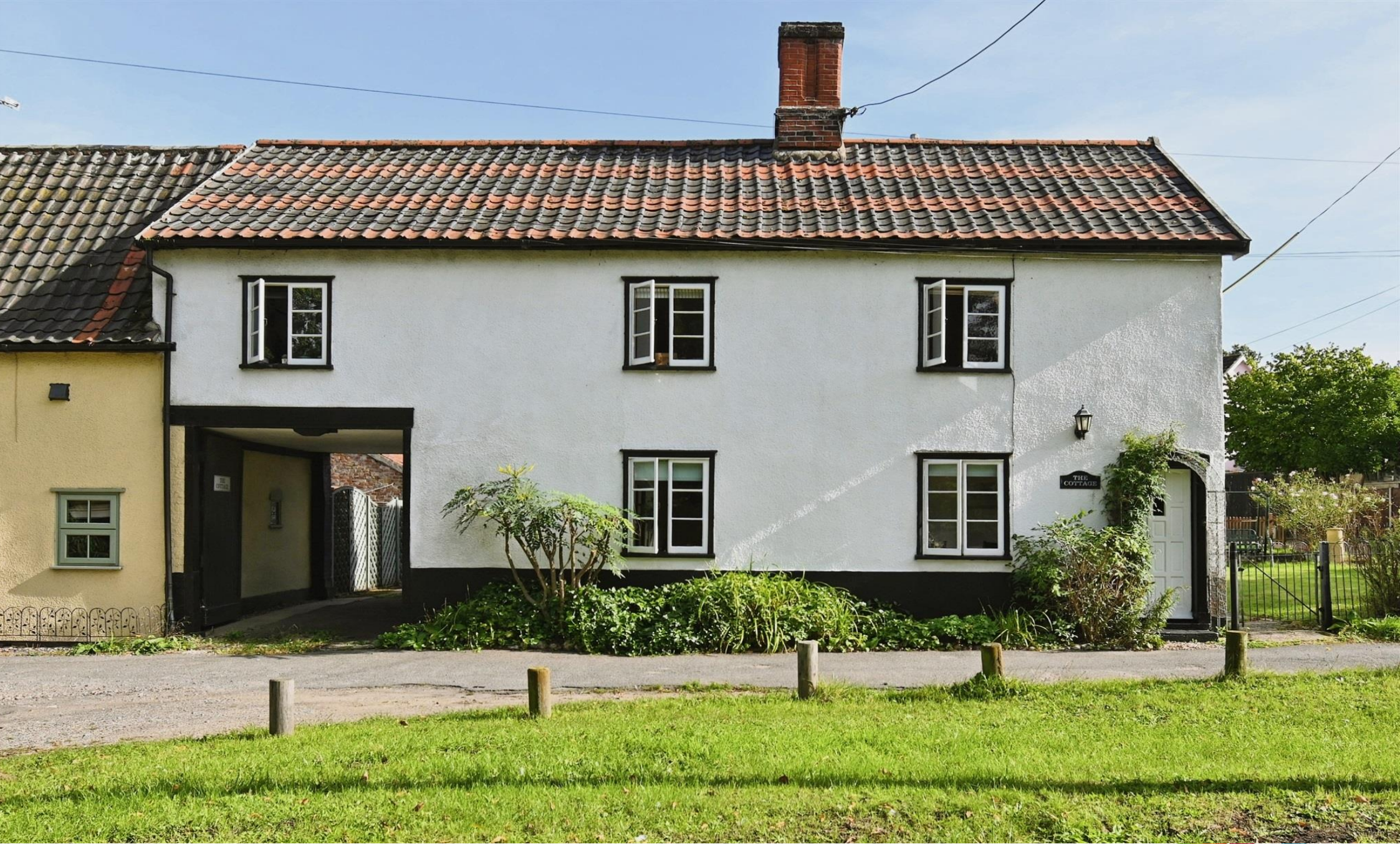
The Cottage The Green, Palgrave Diss IP22 1AG