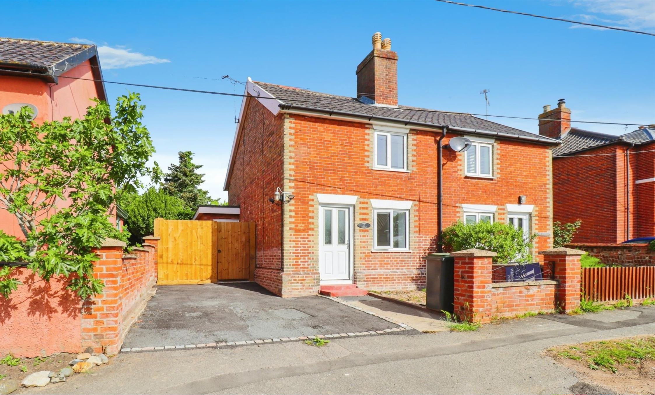
Home Cottage Lows Lane, Palgrave Diss IP22 1AE