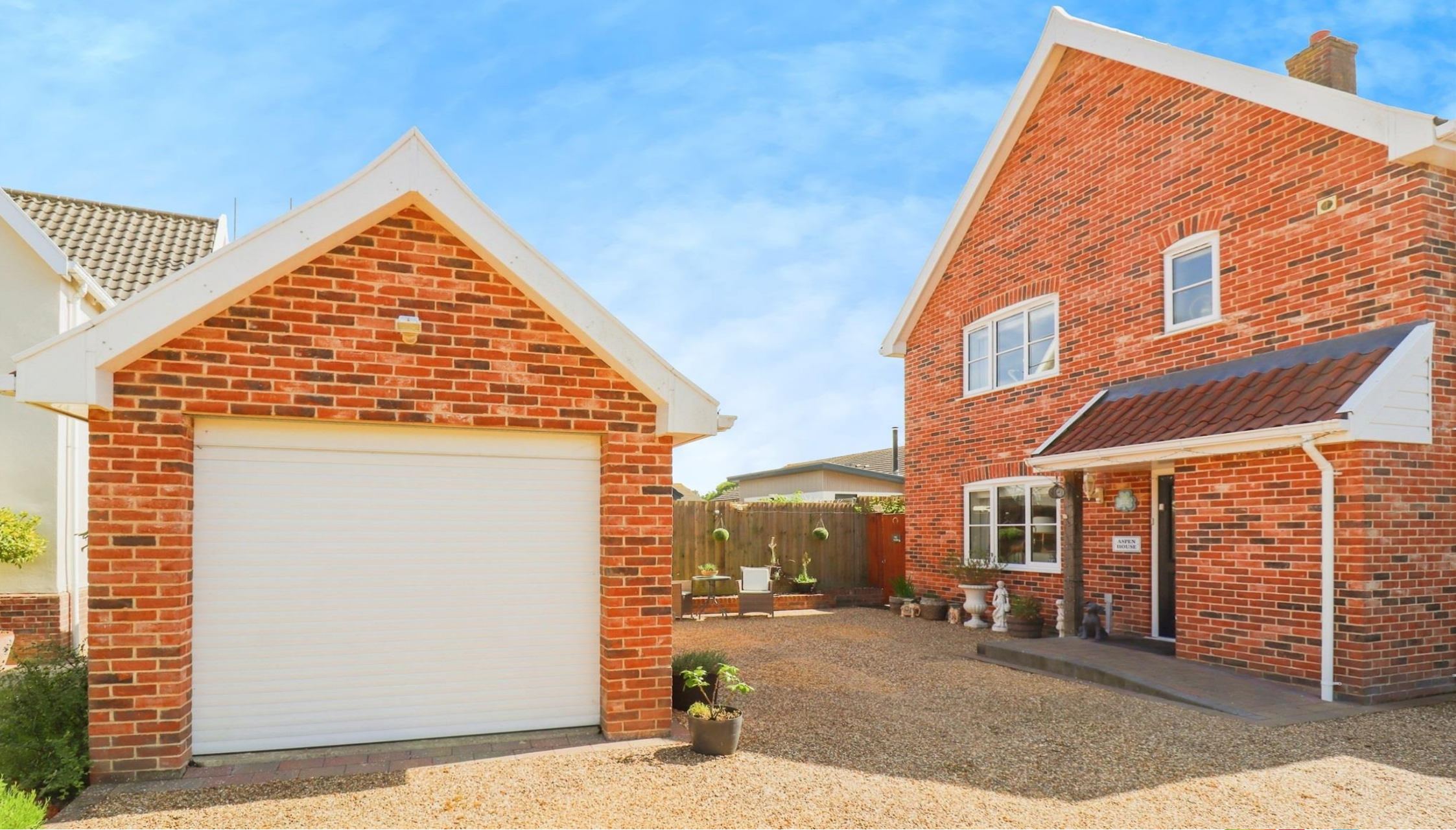
Aspen House Laxfield Road, Stradbroke EYE IP21 5HX