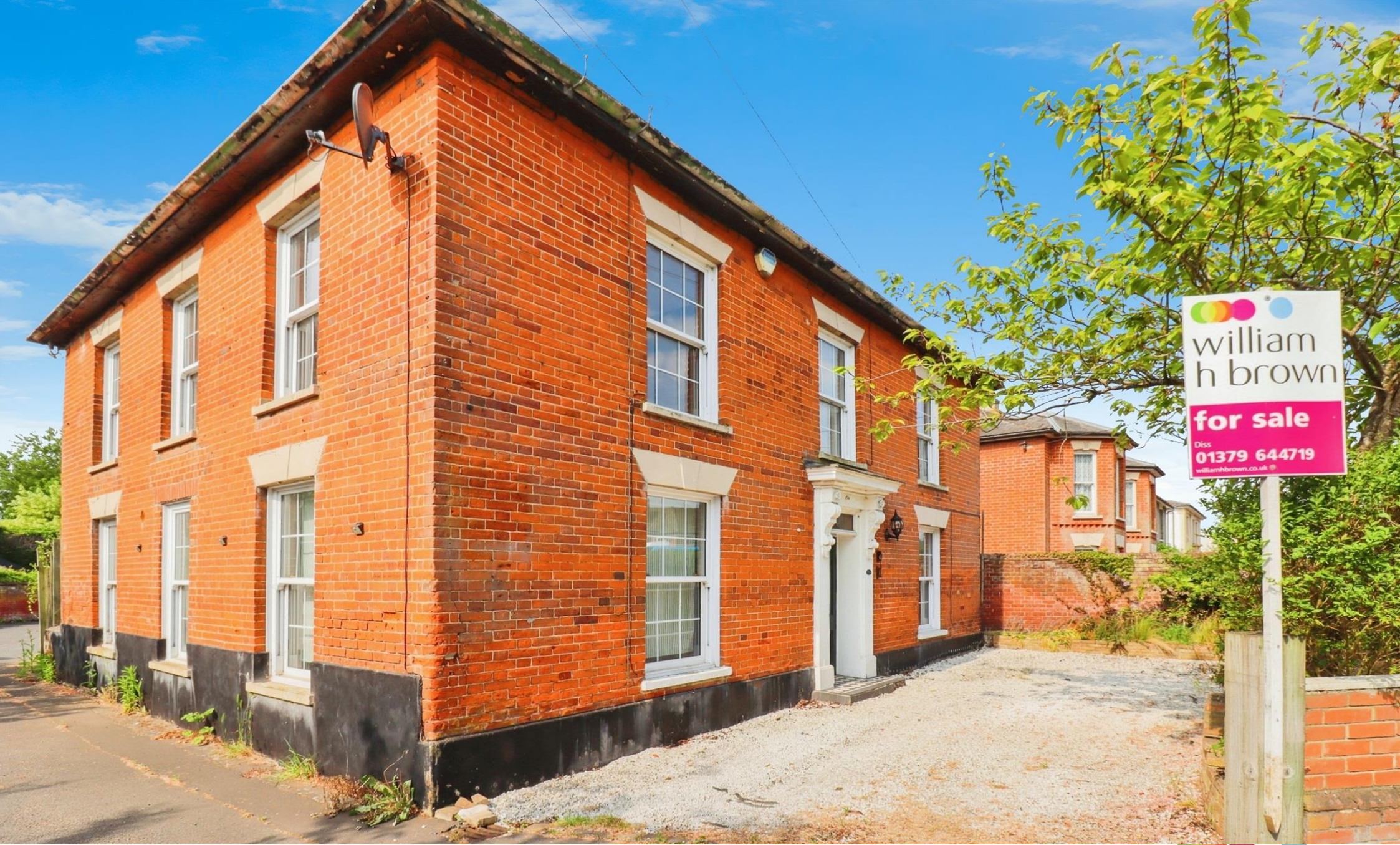
Lion House Victoria Road,Diss IP22 4JG